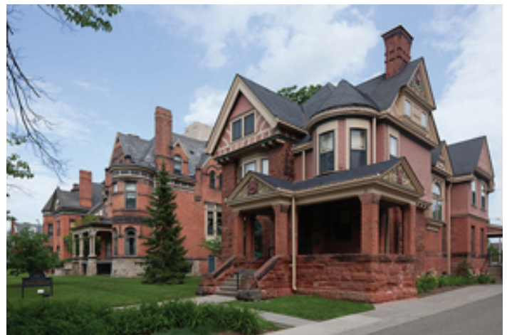
East Ferry Avenue, 1887.