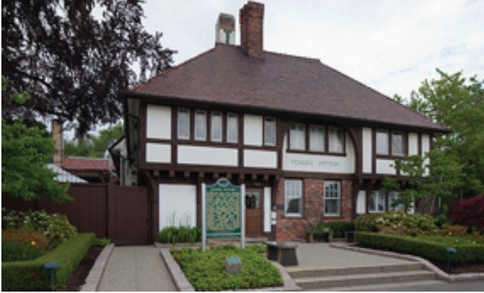
Pewabic Pottery, 1907, W.B. Stratton.