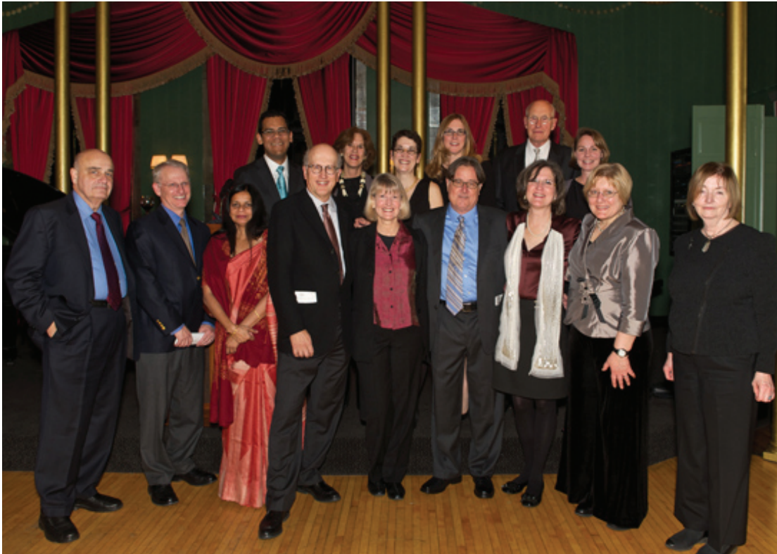
SAH Board at November 12 Gala.

© 2011, All rights reserved, the Society of Architectural Historians