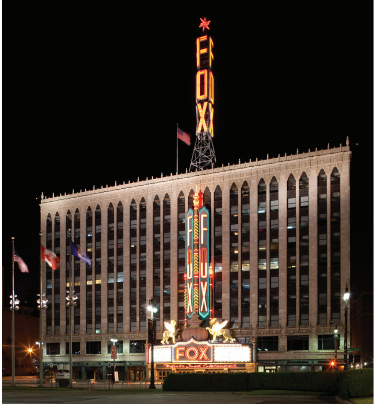
Fox Theater 1928, C. Howard Crane.

Newsletter of the Society of Architectural Historians December 2011 Volume LV, No. 4