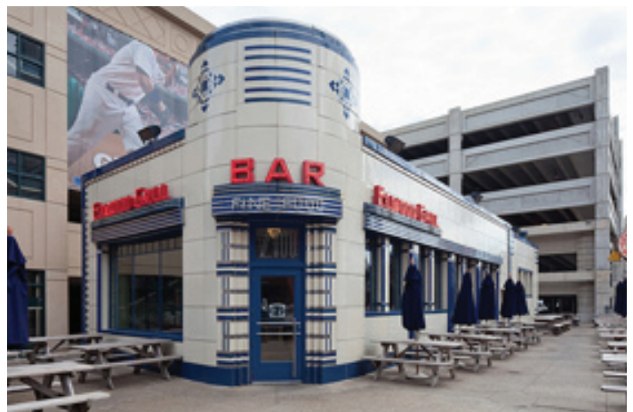
Elwood Bar and Grill, 1936, Charles Noble.

Detroit earned a reputation for design excellence in the mid-twentieth century, led by innovative automobile designers like Harley Earl but also reflected in the architecture, furniture, and other products generated by the area's creative minds. Much of this work came from the Cranbrook artistic community located