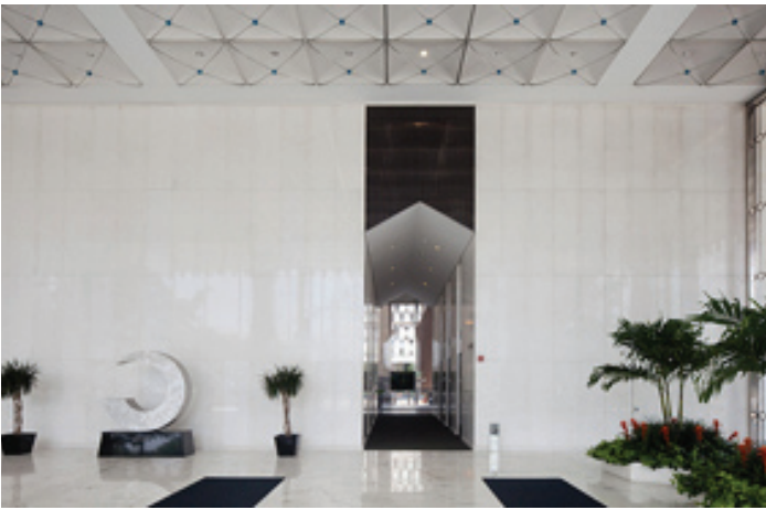
American Natural Resources Building, 1962, Minoru Yamasaki, Interior Lobby.

northwest of the city. The extensive Cranbrook campus was mostly designed by Finnish architect Eliel Saarinen. His talented son, Eero, maintained an office near Cranbrook for almost his entire professional career, and, although the younger Saarinen had few local commissions, his General Motors Technical Center (1956) in Warren is considered a modern masterpiece. His contemporary, Minoru Yamasaki, practiced out of Detroit and the surrounding suburbs for more than three decades and added scores of structures to the local built environment.