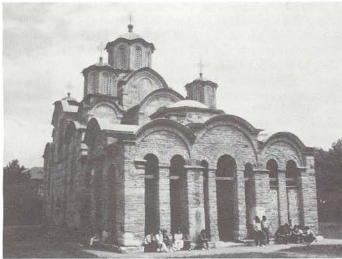
Gračanica, Monastery.