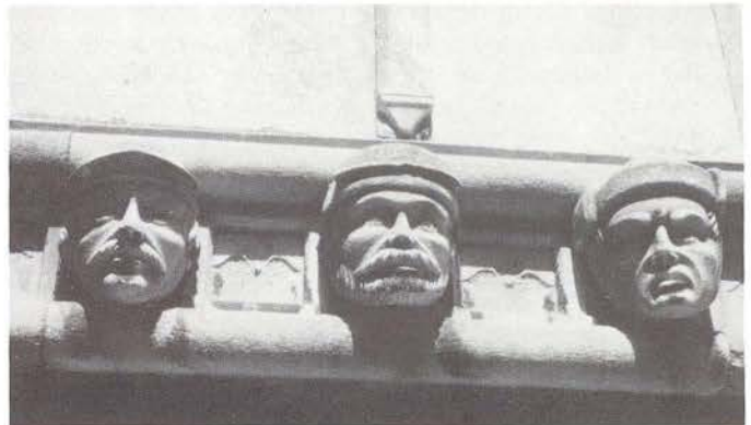
Šibenik Cathedral and Detail of Apse End.

central European style towns in the northern Republics, each with its church steeple capped by an onion dome, there are charming Turkish-style towns in the southern areas, each with its mosque and minaret. A boldly curving new Macedonian Orthodox Cathedral in Skopje emphasizes the separation of that religious group from the Serbian Orthodox church. One republic's holy martyr may be another republic's war criminal. People connected with their neighbors by good roads and modern buses still preserve ancient local dialects, and in the south, wear clothing that we expected to see only in ethnographic museums.