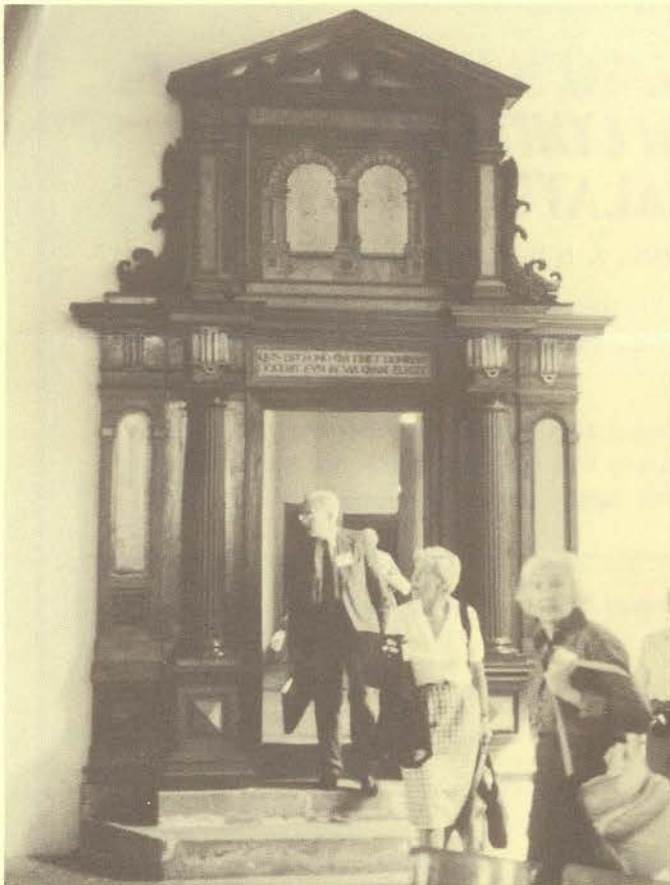
SAH Moves in Schloss at Marburg