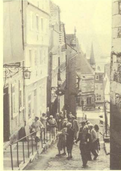
Marburg—SAH Learns How to Climb