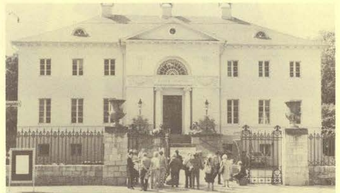
Waiting for the Bus in Front of the Haus Salve Hospice, Braunschweig (1805, by P. J. Krahe)