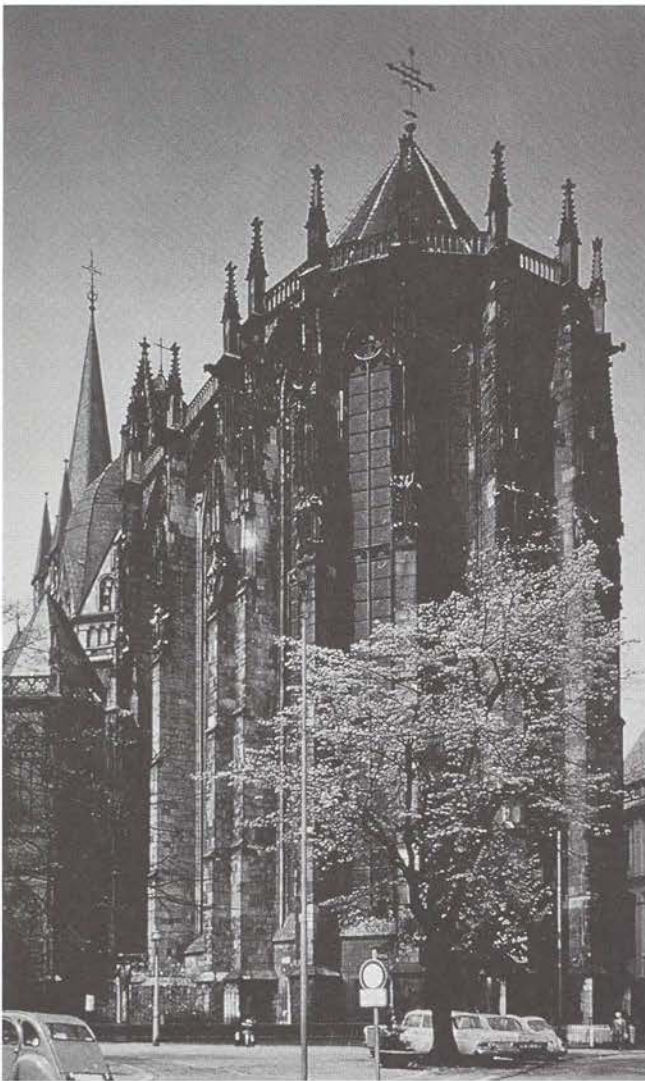
Gothic choir stall, Aachen Cathedral, completed in 1414.

Aachen, Germany — One of Europe's most important cathedrals, the Aachen Cathedral in Germany, has received a grant of $222,000 from the Getty Grant Program. This is the first major grant from the international community to facilitate the preservation of this extraordinary structure. The grant supports the critical first phase of conservation to stabilize the structure of the Cathedral's Gothic choir. The cathedral, originally constructed by Emperor Charlemagne in the 8th century, is located in the city of Aachen, a center for medieval manuscript production. It was the first domed building to be constructed north of the Alps after the Roman era. In addition to being