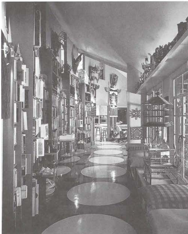
Interior of the Charles W. Moore house.