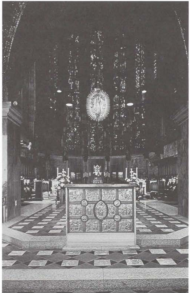
High altar with golden altarpiece, c. 1020. Gothic choir stall, 1414.

Charlemagne's burial place, the church has served as a coronation site for 30 German kings and was one of Christianity's major pilgrimage sites during the Middle Ages. Charlemagne's octagonal Palatine Chapel synthesizes late Roman and Byzantine styles—symbolic of a Europe recently conquered and unified under his rule.