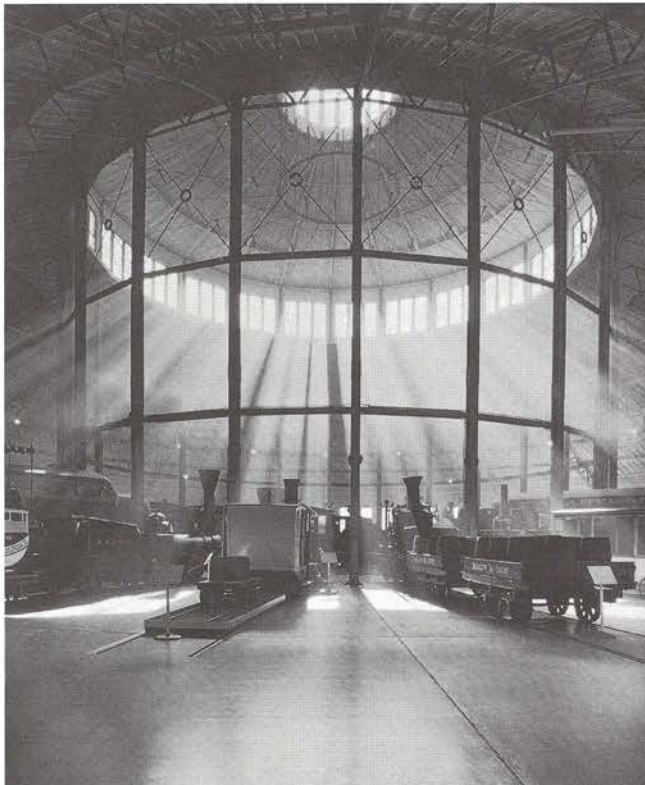
Baltimore's B&O Railroad museum has one of the largest collections of railroad equipment in North America. This group of locomotives and rail cars is on display in the former roundhouse.