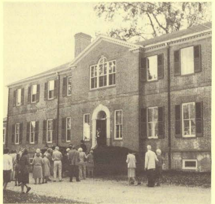
SAH group before Elmwood, ca. 1775