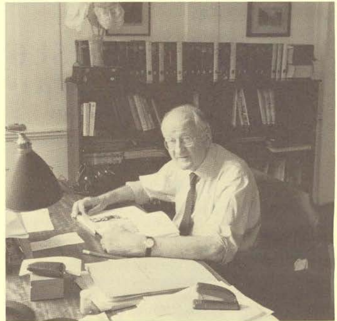
Sir Nikolaus Pevsner in his Bloomsbury Square Office, June 1971.

An exhibit American Architecture: Innovation and Tradition is a 7-part traveling exhibition examining the cultural and environmental conditions that have determined the course of building design in America. The exhibit, which