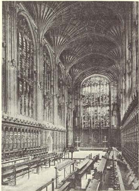
The Chapel, Kings College, Cambridge University

Arrangements have been made to secure a limited number of accommodations at Cambridge University, August 16-19, 1973, where the joint annual meeting sessions will be held with SAH-Great Britain. If we secure sufficient response from our members, group or charter flights (from New York City and, perhaps, Chicago) will leave the United States on Wednesday, August 15, 1973, arriving London's Heathrow Airport on the morning of August 16; participants will be transferred from Heathrow to Cambridge by chartered bus.