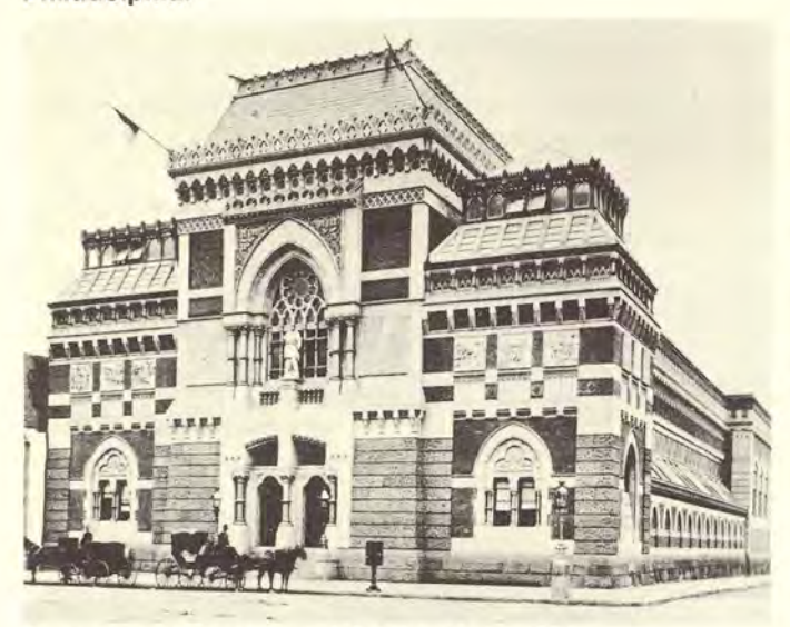
Pennsylvania Academy of the Fine Arts-1876

Preregistration for the meeting closes April 30, 1976. Members and guests are reminded that no tickets for the annual luncheon-business meeting may be purchased at the time of the meeting after Thursday noon, May 20. Hotel reservations should be made as soon as possible, but no later than May 4, 1976. IMPORTANT: See enclosed letter from the Hilton Hotel of Philadelphia.